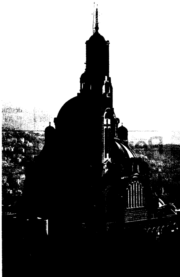
The Byzantine Rite Mekite Catholic Basilica of St Paul at Harissa Lebanon

Terms banned include the word Allāh , ‘God,’ solat